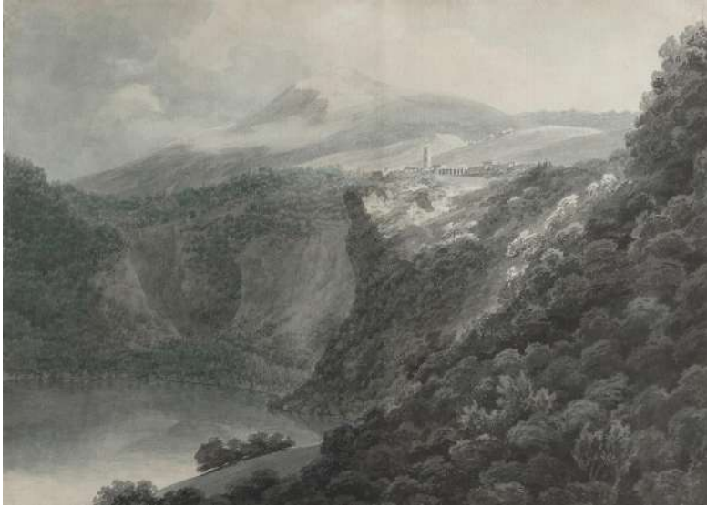
John Roberts Cozens (1752-1797), The Lake and Town of Nemi , Bonhams .

Among highlights coming to the rooms this summer is a large work by John Roberts Cozens of the lake and town of Nemi, made on his first trip to Italy in 1776-1779. Of the five recorded versions of this composition the present one is nearly double the size of the other variations, likely intended as a challenge to the popular notion that oil paintings were in some way superior to watercolours and demonstrated that landscapes painted on paper could be every bit as eloquent, technically impressive and valid as their counterparts on canvas.