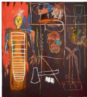
Lot 22 Jean-Michel Basquiat Air Power , 1984 Acrylic and oilstick on canvas Estimate: £2.5-3.5million Sold for: £7,093,000 Buyer: Private Collector

Bowie played the role of Andy Warhol in the 1996 film Basquiat .