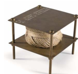
Lot 34 Marcel Duchamp With Hidden Noise (Un Bruit Secret) , 1964 Assisted Readymade Estimate: £180,000-250,000 Sold for: £557,000 Buyer: Anonymous

There are eight works by Lanyon in the sale, three of which, including Witness , were loaned to the 2010 Tate St Ives retrospective.