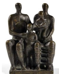
Lot 12 Henry Moore Family Group , 1944 Bronze Estimate: £250,000-350,000 Sold for: £581,000 Buyer: European Private Collector

"His work relates to rock in ways that very few other visual artists get near", David Bowie, Modern Painters , 1996.