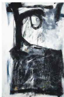
Lot 20 Peter Lanyon Witness , 1961 Oil on canvas Estimate: £250,000-350,000 Sold for: £797,000 (RECORD) Buyer: Private Collector

David Bowie enthusiastically collected works by British sculptors who were exhibited at the 1952 Venice Biennale including Henry Moore and Kenneth Armitage.