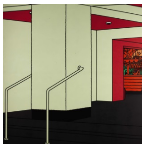
Lot 43 Patrick Caulfield Foyer , 1973 Acrylic on canvas Estimate: £400,000-600,000 Sold for: £665,000 (RECORD) Buyer: Private Collector

"My God, yeah! I want to sound like that looks" (David Bowie).