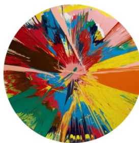
Lot 47 Damien Hirst Beautiful, shattering, slashing, violent, pinky, hacking, sphincter painting , 1995 Household gloss on canvas Estimate: £250,000-350,000 Sold for: £755,000 Buyer: US Private

Bowie played the role of Andy Warhol in the 1996 film Basquiat .