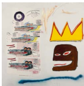
Lot 22 Jean-Michel Basquiat Untitled , 1984 Acrylic, spraypaint and paper collage on canvas Estimate: £500,000-700,000 Sold for: £7,093,000 Buyer: Private Collector

David Bowie generously loaned this to the Tate Britain exhibition in 2013.