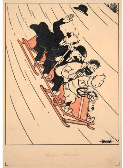
Lot 499A: Hergé (Georges Rémi dit), 'Cartes neige', China Ink and watercolour on paper 1942/1943, original drawing and printed edition, sold for 146 700 € / 155 502 $ inc. premium (estimation: 60 000 - 120 000 €)

True leaders in the field, Artcurial has decided to reveal this exceptional collection in Hong Kong in October where the auction house previously organised Asia's first European Comic Strip auction