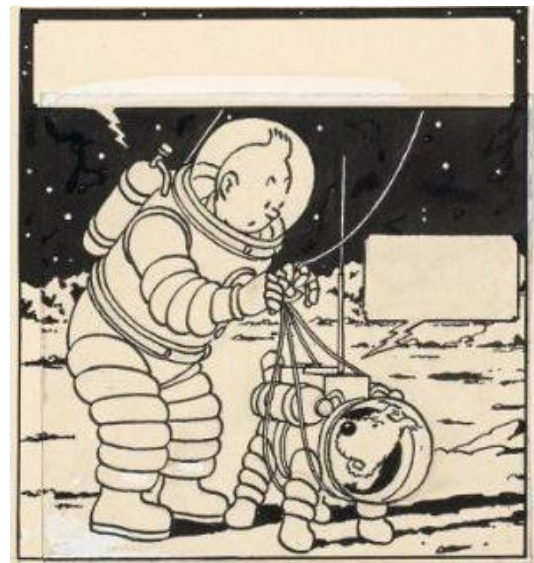
Détail //Lot 498 : HERGE (Georges Rémi dit), historical plate from the album On a marché sur la lune, published in 1954, sold for 1 553 312 € / 1 646 510 $ inc. premium (estimation: 700 000 - 900 000 €)